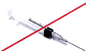
NO Needles (Keep medical waste out of recycling. Place in safe disposal containers like Waste Management's MedWaste Tracker® box.)

To Learn More Visit: RecycleOftenRecycleRight.com