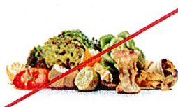
NO Food Waste (Compost instead!)