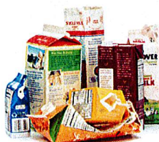
Food & Beverage Cartons