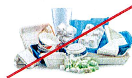
NO Foam Cups & Containers (Check Earth911.org for options.)