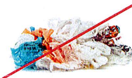
NO Plastic Bags & Film (Find a recycling site at plasticfilmrecycling.org )